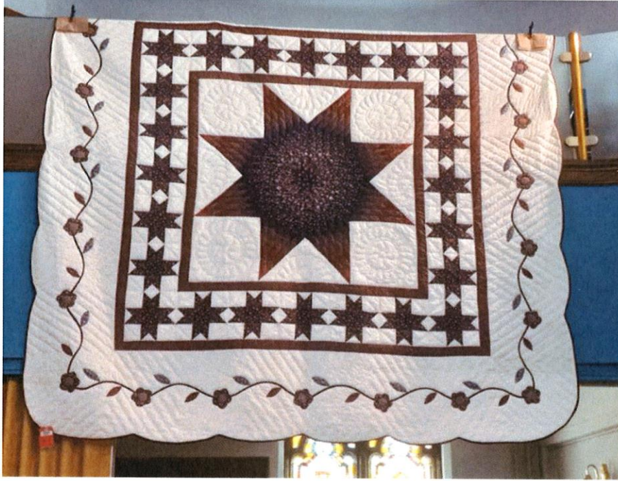
Quilt up for auction: Star Quilt with border, 113 inches x 106 inches This photo doesn't do this lovely quilt justice! Be sure to see the quilt hanging in the upper social hall at the church.

When: bids will be received between April 1 and April 30, 2022