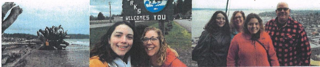
March – Seattle Space Needle, Portland, Vancouver, & Forks WA inspiration Twilight movies