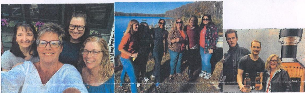
Great friends at the lake & the BEST ADVENTURE so far Outlander (Netflix) & The Sassenach

Pictures are worth a thousand words, as I sit to reflect on 2022, very thankful for our health and many happy memories, I can't believe how quickly time flies by and pray that we all spend it doing what we love with those we love. Happy holidays to all of you, Happy New Year, and hope to see you in person in 2023!