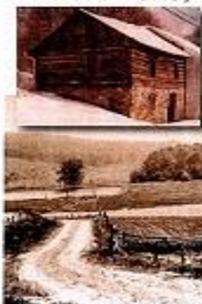
Schubert-Graber Cabin, circa 2014

Example of our work using approved cleaning methods