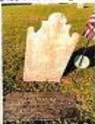
Powder Valley, circa 1900