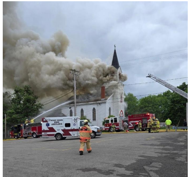
Trinity UCC Church, Dorseyville, PA